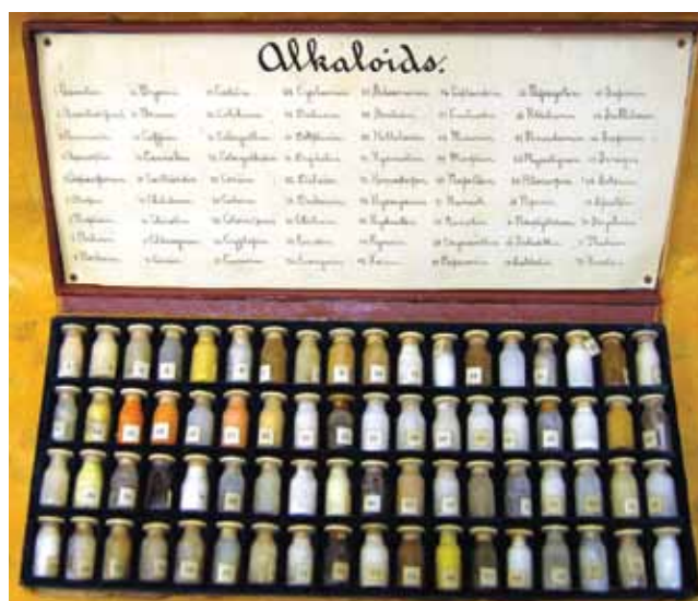
72 alkaloids in their case.

The full list of alkaloids is published on our departmental Web page ( http://www.chem.unl.edu/alumni/ ) so you can do your own research, but please let me know what you find. I'd also welcome other hypotheses. If you do have any information on this case of 72 alkaloids, please email me at mgriep1@unl.edu . I look forward to hearing from you!