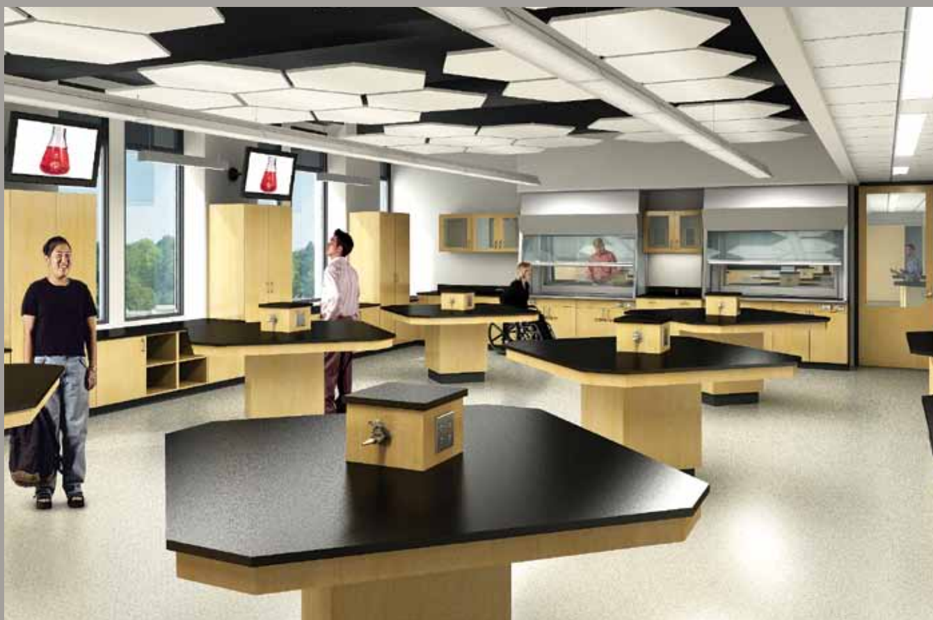
A rendering done by HDR, the architect for the undergrad lab renovation, shows what the completed labs will look like.