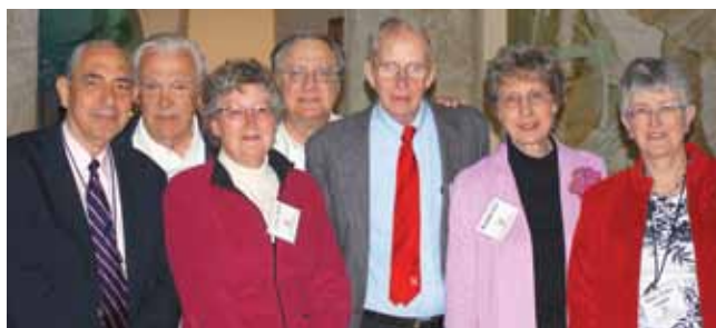
A group of reunion attendees stop to pose for a photo at the 2011 Chemistry Reunion Alumni Banquet.

"At the moment, I am extremely optimistic about the trajectory of UNL chemistry. A number of seemingly intractable obstacles of recent years are now yielding to the efforts of departmental leadership, energetic professionals and staff, and a supportive administration. Being associated with the Big 10 will further encourage these promising trends."