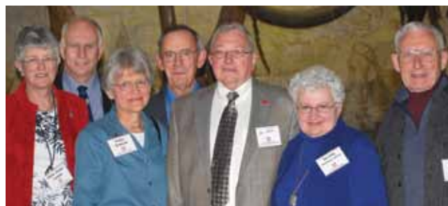
A group of reunion attendees stop to pose for a photo at the 2011 Chemistry Reunion Alumni Banquet.