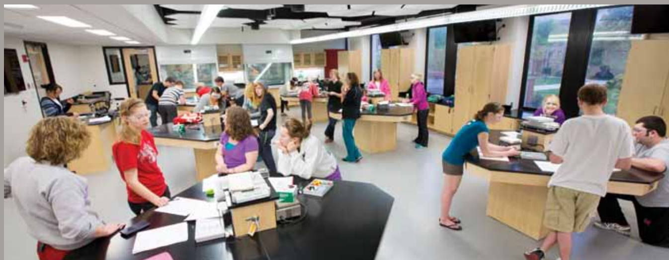
Renovated Undergraduate Lab