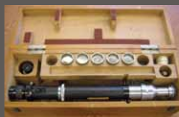
Immersion Refractometer (Bausch & Lomb) purchased by Washburn in 1931 to measure his ternary mixtures.